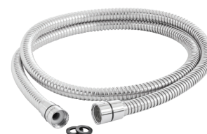
2m Anti-twist Hose - Chrome TSHG1266