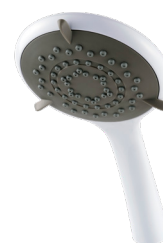
Care Shower head (5 Spray Pattern) TSHECAREWHT